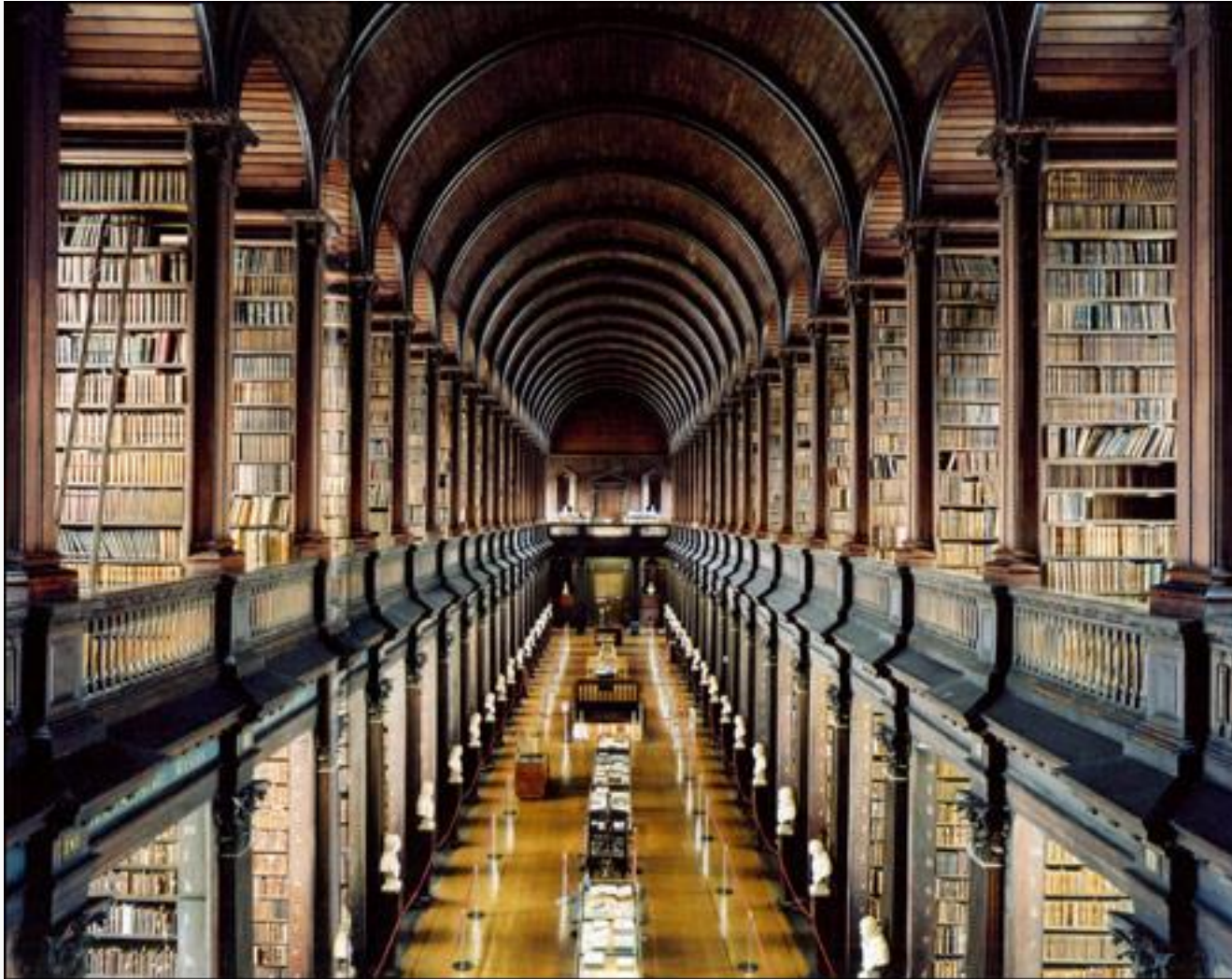
Trinity College Library Univ. of Dublin