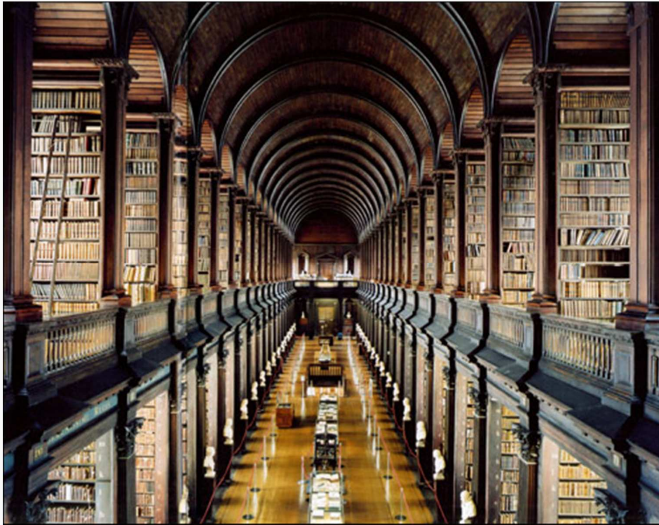
Trinity College Library Univ. of Dublin