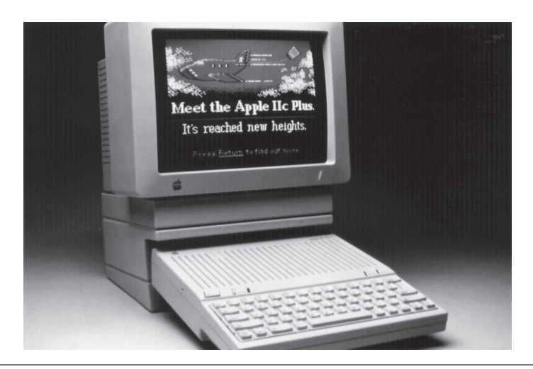
FIGURE 1.10.5 The Apple IIe Plus. Designed by Steve Wozniak, the Apple IIe set standards of cost and reliability for the industry.

But even with a four-year head start, Apple's personal computers finished second in popularity. The IBM Personal Computer, announced in 1981, became the best-selling computer of any kind; its success gave Intel the most popular microprocessor and Microsoft the most popular operating system. Today, the most popular CD is the Microsoft operating system, even though it costs many times more than a music CD! Of course, over the more than 25 years that the IBM-compatible personal computer has existed, it has evolved greatly. In fact, the first personal computers had 16-bit processors and 64 kilobytes of memory, and a low-density, slow floppy disk was the only nonvolatile storage! Floppy disks were originally developed by IBM for loading diagnostic programs in mainframes, but were a major I/O device in personal computers for almost 20 years before the advent of CDs and networking made them obsolete as a method for exchanging data.