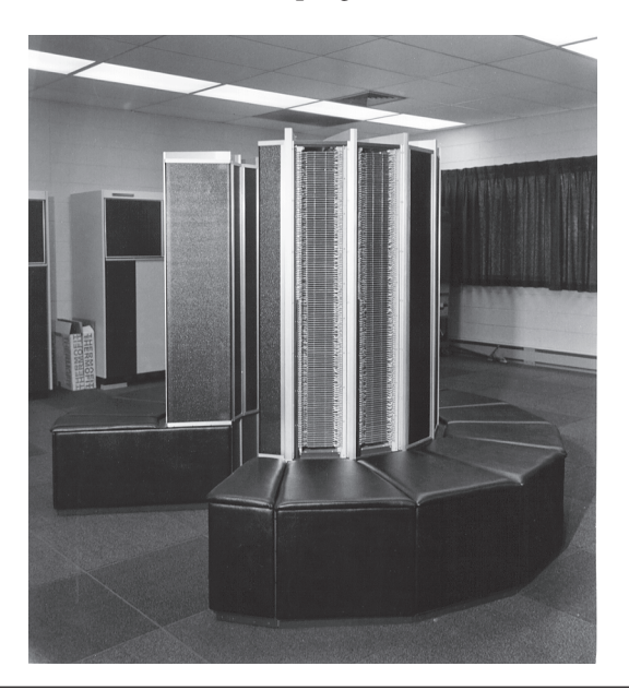
FIGURE 1.10.4 Cray-1, the first commercial vector supercomputer, announced in 1976. This machine had the unusual distinction of being both the fastest computer for scientific applications and the computer with the best price/performance for those applications. Viewed from the top, the computer looks like the letter C. Seymour Cray passed away in 1996 because of injuries sustained in an automobile accident. At the time of his death, this 70-year-old computer pioneer was working on his vision of the next generation of supercomputers. (See www.cray.com for more details.)

In 1963 came the announcement of the first supercomputer . This announcement came neither from the large companies nor even from the high tech centers. Seymour Cray led the design of the Control Data Corporation CDC 6600 in Minnesota. This machine included many ideas that are beginning to be found in the latest microprocessors. Cray later left CDC to form Cray Research, Inc., in Wisconsin. In 1976, he announced the Cray-1 (Figure 1.10.4). This machine was simultaneously the fastest in the world, the most expensive, and the computer with the best cost/performance for scientific programs.