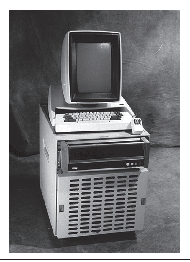
FIGURE 1.10.6 The Xerox Alto was the primary inspiration for the modern desktop computer. It included a mouse, a bit-mapped scheme, a windows-based user interface, and a local network connection.

that were donated to universities. Among the technologies incorporated in the Alto were: