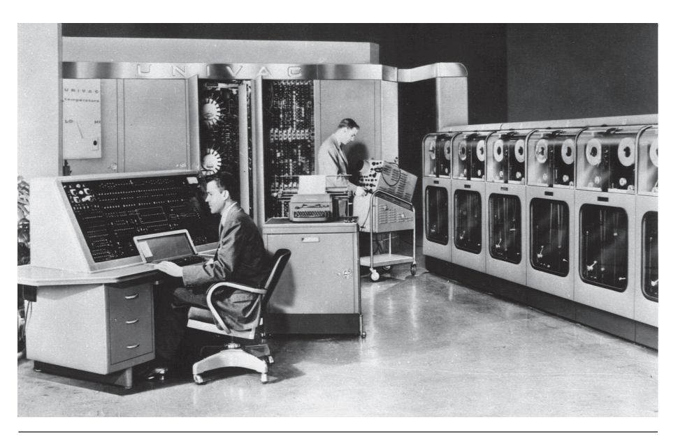
FIGURE 1.10.2 UNIVAC I, the first commercial computer in the United States. It correctly predicted the outcome of the 1952 presidential election, but its initial forecast was withheld from broadcast because experts doubted the use of such early results.

shown in August 1949. After some financial difficulties, their firm was acquired by Remington-Rand, where they built the UNIVAC I (Universal Automatic Computer), designed to be sold as a general-purpose computer (Figure 1.10.2). First delivered in June 1951, UNIVAC I sold for about $1 million and was the first successful commercial computer—48 systems were built! This early machine, along with many other fascinating pieces of computer lore, may be seen at the Computer History Museum in Mountain View, California.