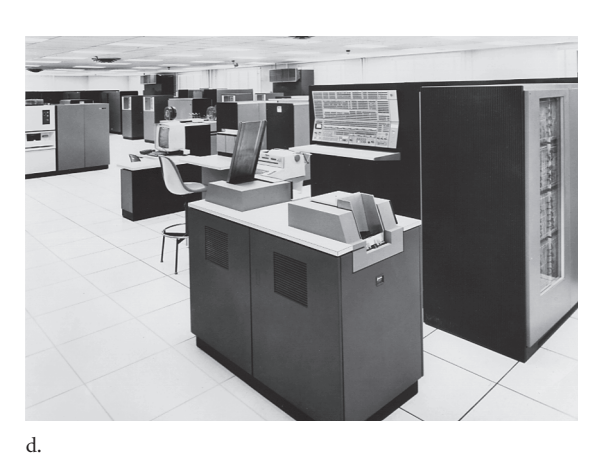
FIGURE 1.10.3 IBM System/360 computers: models 40, 50, 65, and 75 were all introduced in 1964. These four models varied in cost and performance by a factor of almost 10; it grows to 25 if we include models 20 and 30 (not shown). The clock rate, range of memory sizes, and approximate price for only the processor and memory of average size: (a) model 40, 1.6 MHz, 32 KB–256 KB, $225,000; (b) model 50, 2.0 MHz, 128 KB–256 KB, $550,000; (c) model 65, 5.0 MHz, 256 KB–1 MB, $1,200,000; and (d) model 75, 5.1 MHz, 256 KB–1 MB, $1,900,000. Adding I/O devices typically increased the price by factors of 1.8 to 3.5, with higher factors for cheaper models.

Moving the idea of the architecture abstraction into commercial reality, IBM announced six implementations of the System/360 architecture that varied in price and performance by a factor of 25. Figure 1.10.3 shows four of these models. IBM bet its company on the success of a computer family , and IBM won. The System/360 and its successors dominated the large computer market.