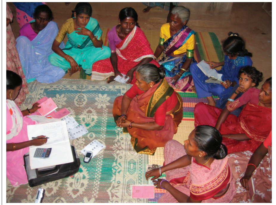
Figure 2: Field staff capturing data from a self-help-group meeting.

Working with SHGs is attractive for local banks, as they lessen the need to build physical branch offices in remote areas and thereby reduce the cost of providing financial services. However, banks often have no way to address SHG quality and history, making it difficult to determine the risks associated with various products and services (such as the lending of money). Due to limited literacy and education, many SHGs keep inconsistent and/or incomplete records. Many need the help of literate people, sometimes the field staff of a local NGO, to maintain their records