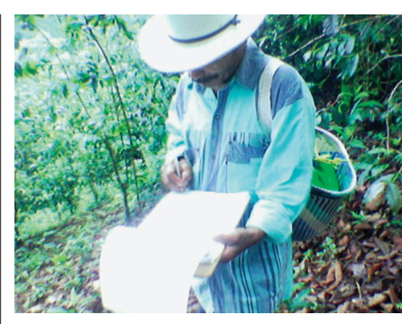
Figure 3: Photo used as evidence that field staff visited a particular farm parcel.

The same technology and process can be used to provide traceability, grading, collecting feedback from farmers, monitoring social and economic impact, and instituting reward mechanisms tied directly to farm-level quality. Digital ICS is one of the first systems to provide these features in