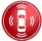
Automatic Crash Response