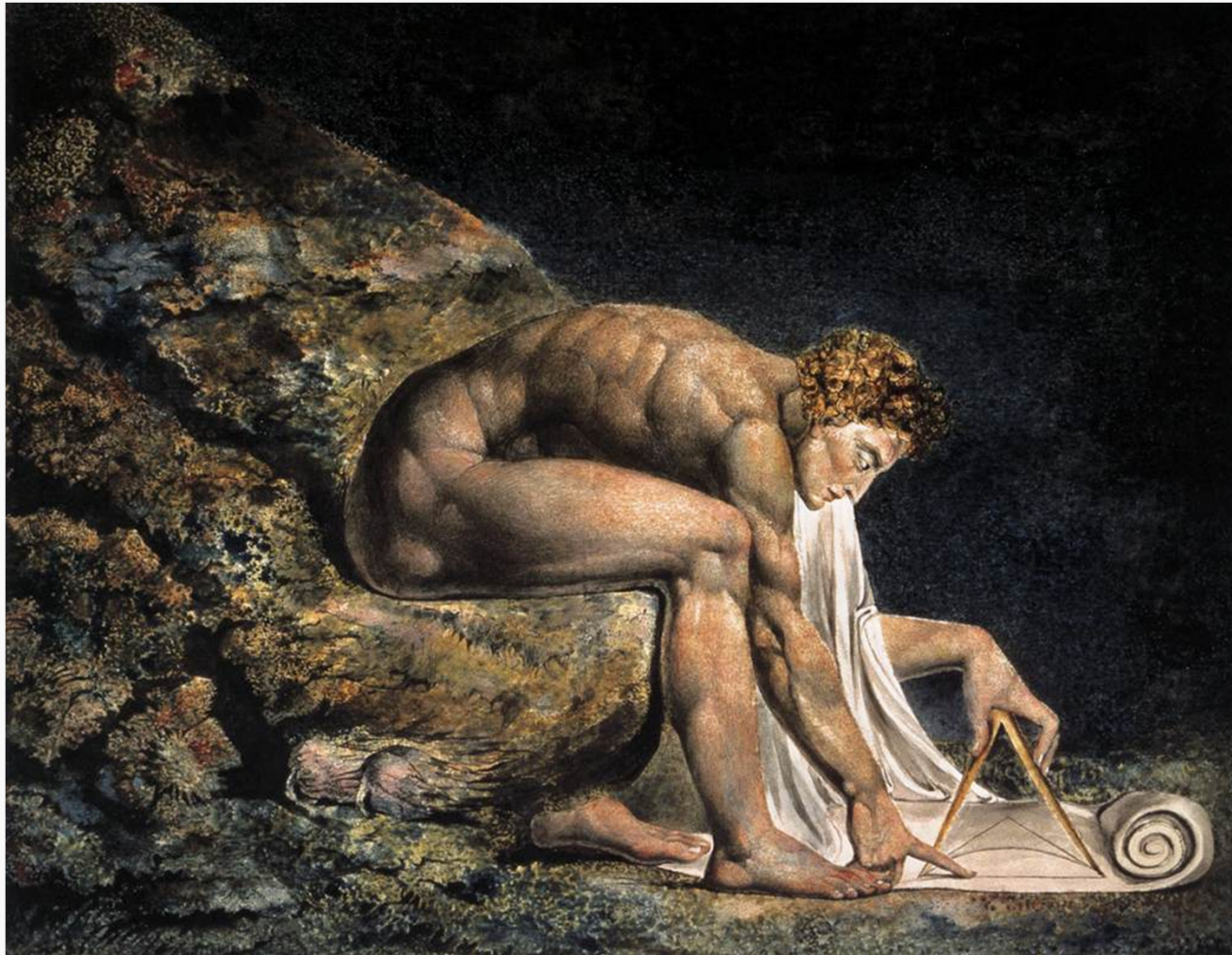
Isaac Newton Wm Blake (1795)